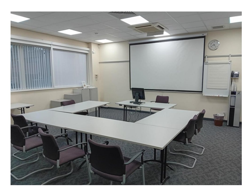
Typical meeting room with 'U' shaped setup