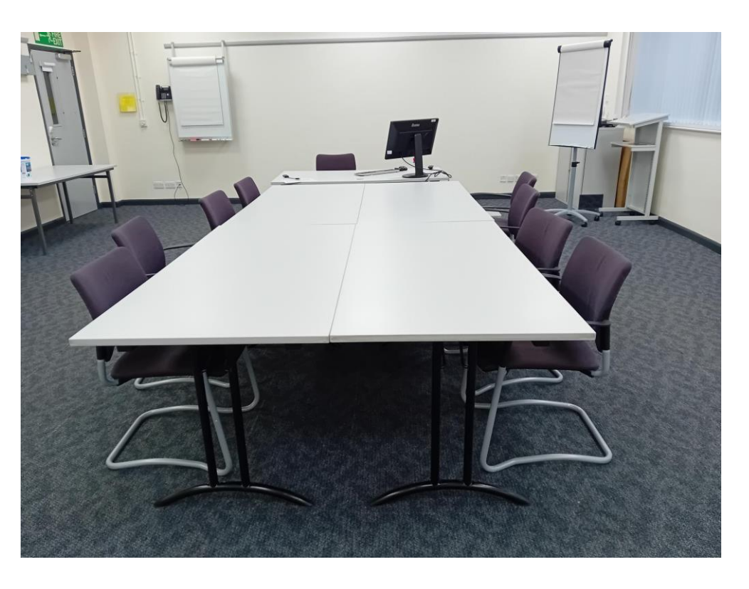
Typical meeting room with 'board room' setup