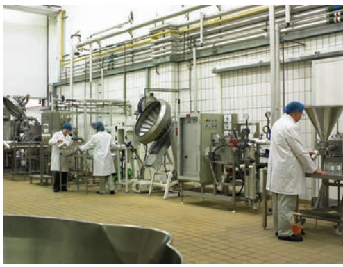
Pilot plant, here for you to use