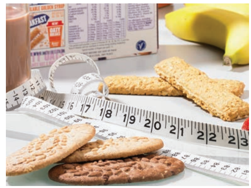
Nutrition and health