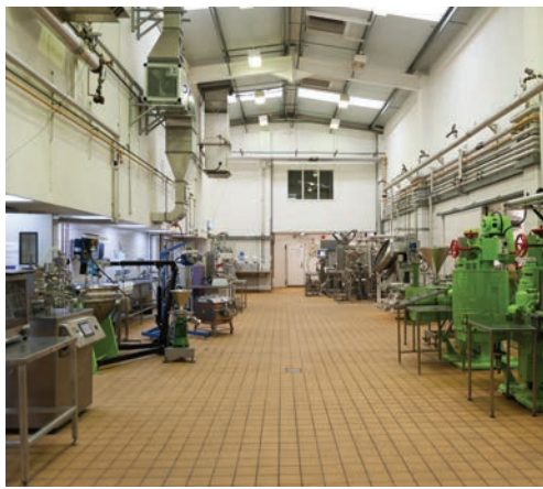
Pilot plant, here for you to use