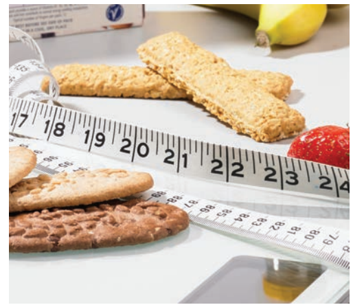
Nutrition and health