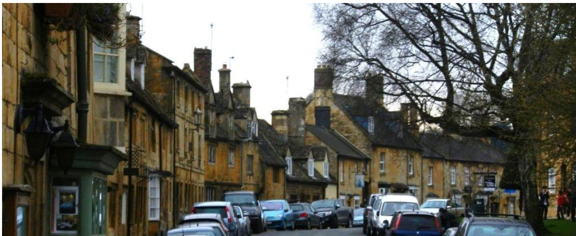
Chipping Campden (UK)

This task was approached through one-to-one discussions with potential end-users in a dedicated consortium workshop at the 1 st Plenary Meeting, held at Campden BRI, Chipping Campden (UK) in April 2014.